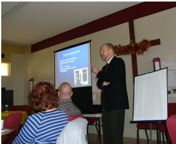
More Diocesan Road Show Pictures

The birth of a new liturgical year offers us opportunity to deepen in this awareness or if we have lost our way, to find it again. The lyricist who penned the words about Christmas, "It's the most wonderful time of the year" was probably unaware of how on target were his words because it reminds us about the holy child whose presence can grow within us throughout the year! Alleluia, alleluia, alleluia!