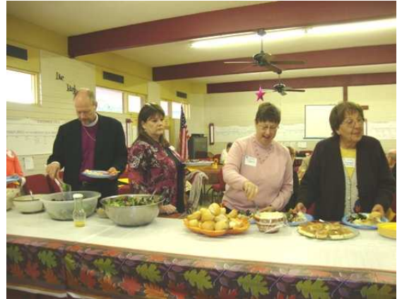
Parishioners and visitors alike enjoyed a sumptuous luncheon prepared by our St. Matthew's Angels.