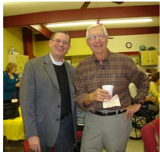
The Diocesan Road Show—Nov. 14 (cont.)