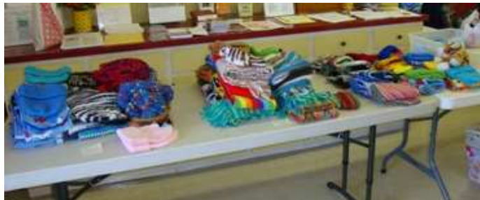
What child wouldn't be thrilled to receive one of those lovely sets?