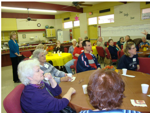
The Parish Hall was full of attentive listeners.